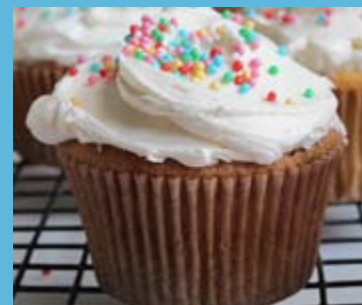
Cupcakes baked specially for Rights People by Caroline Wright www.thewrightrecipes.com

With mixer on lowest setting, beat sugar and vanilla into butter until incorporated. Beat frosting on medium speed for 2 minutes, or until light and fluffy.