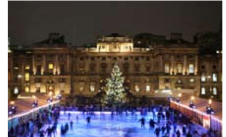
Festive Ice-skating in London at Somerset House