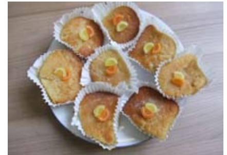
See the back/next page for the delicious lemon drizzle cupcake recipe from the kitchen of Caroline Hill-Trevor.